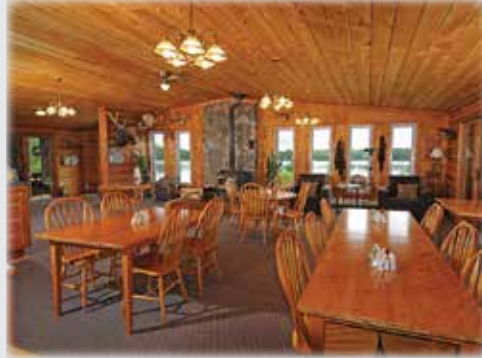
One Man Lake